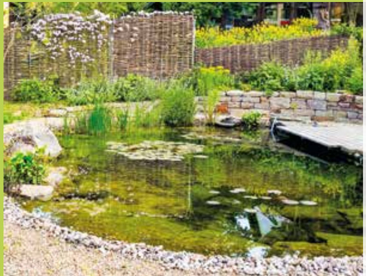
Pond in a private garden, Dattenberg